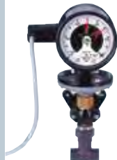
vacuum contact pressure gauge