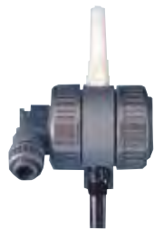
3/4" injector up to 4 kg/h Cl 2 anti-syphon