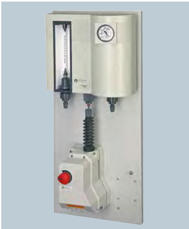
PRE-ASSEMBLED INSTALLATION OF THE V10K AUTOMATIC SYSTEM

The SFC PC process controller saves its responses related to control deviations and uses this data for future control calculations. So the actuating control output is optimized by fast reaction on flow value and continuously adjusted control parameters through memory data.