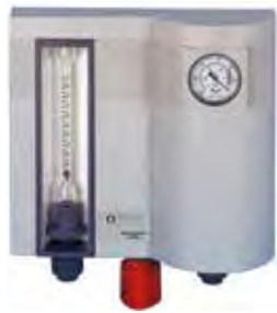
V10k manual system