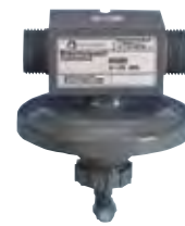
safety vent valve