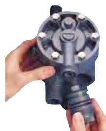
1" injector up to 10 kg/h Cl 2 anti-syphon