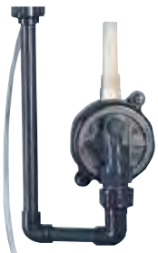
3/4" injector up to 4 kg/h Cl 2