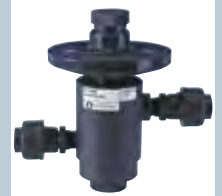
vacuum safety valve

FLEXIBLE CONFIGURATIONS: THE V10K™ GAS FEED SYSTEM IS AVAILABLE IN DIFFERENT DESIGNS