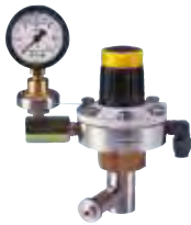
4 kg/h vacuum regulator