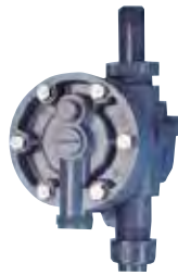
1" injector up to 10 kg/h Cl 2