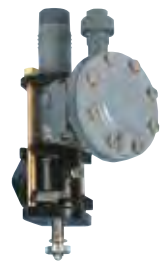
2" injector up to 15 kg/h Cl 2