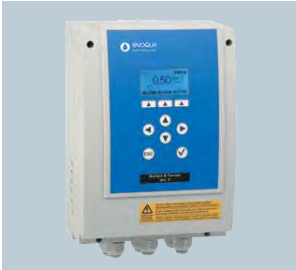
SFC MEASUREMENT AND CONTROL SYSTEM

With the V10k™ system the following control modes are available: