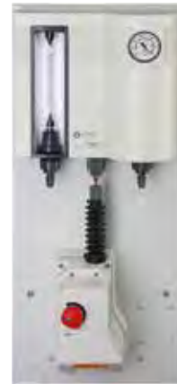
V10k automatic system