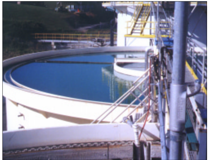
The Smith & Loveless CLAR-I-VATOR® is a solids contact clarifier.

In a sludge blanket clarifier, chemicals are added internally with some form of flocculating mechanism such as a horizontal paddle or a vertically mounted re-circulator. Chemicals are