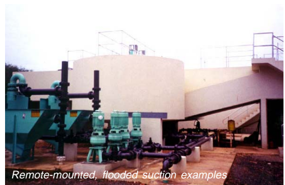
Remote-mounted, flooded suction examples

As the hopper fills, the pump is triggered, eliminating continuous pumping.