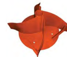
PMSL TALON IMPELLER