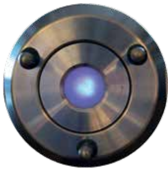
O 2 O Optical